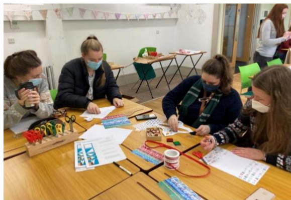
Students participating in lunchtime wellbeing activities

Throughout the year, Norland created a series of initiatives to support student wellbeing. Notably, Norland paid out £45,000 to students from a hardship fund, which played a key role in improving the wellbeing of many students. Additional funding was made available to provide a range of activities either in person or online. These included weekly lunchtime activities, such as craft activities, pizza lunches and cake decoration. Attempts were made to make up for the lack of social gatherings by providing socially distanced picnics in the park, coffee-and-cake sessions, and rounders matches when allowed. Online activities included workout sessions, cooking competitions, escape-room challenges, a quiz, a scavenger hunt and an online Christmas party for staff and students with prizes galore.