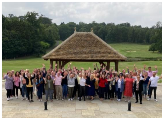
Norland full staff away day, 2021

Over the 2020/21 financial year, natural attrition accounted for 11 leavers. Three of these posts were fixed term and were due to end during the academic year. The remaining eight left for a variety of reasons ranging from retirement to reassessing their lives in light of the pandemic. All eight posts were successfully reappointed with slight adjustments made to the roles to accommodate revised operational models.