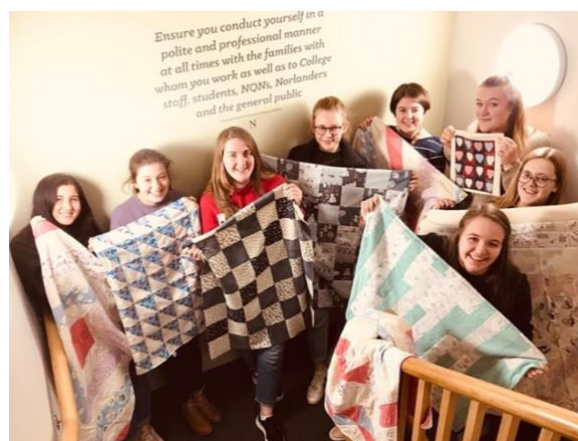
Cot quilts created by Set 43 students

Cot quilts made by Set 43 students in their first year were delivered to the Children's Hospice South West to furnish the children's rooms. The Charities and Communities Coordinators are delighted to have received funding from the Norland Foundation to recruit three student representatives to assist them in their work, and they look forward to setting up new Charity and Community student reps next year.