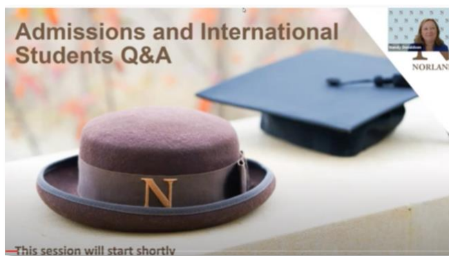
Norland Q&A session – Admissions and International Students

In April 2021, Norland was granted an international student sponsor licence. Not only does this allow us to continue to recruit students from the EU following Brexit, but it also opens up the international student recruitment market and enables us to meet some of the high demand for Norland graduates worldwide through the Norland Agency. To support this aim, specific information, advice and guidance has been created, which is communicated through our social media, open days, Q&A sessions for international students and dedicated newsletters, as well as in our prospectus and on our website. An analysis of demand –