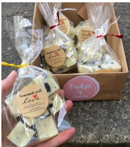
Fudge 4 Charity sale

Over the year, two part-time Charities and Communities Coordinators continued to oversee the wealth of charitable and community-based activities undertaken by staff and students. Through 19 different charitable activities, over £11,000 was raised during the year, despite the challenging circumstances that Covid created. These activities included cake sales, hair donation, and charity walks and runs. Students put their creative skills to good use by making Christmas wreaths in aid of the Royal United Hospital. One enterprising student set up fudge sales to raise funds for Cancer Research UK, which proved highly popular. Several competitions